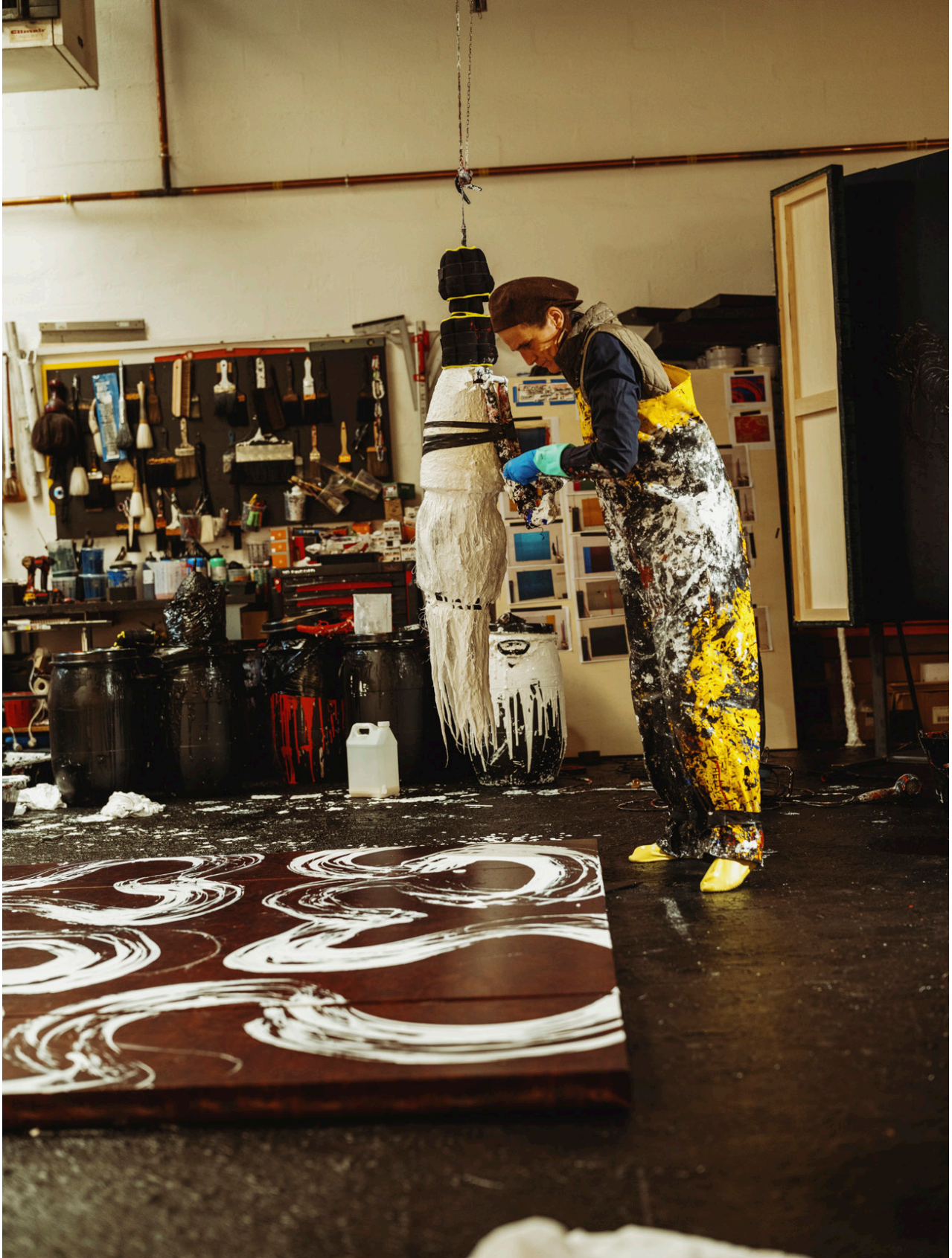
Fabienne Verdier in her studio, 2024.