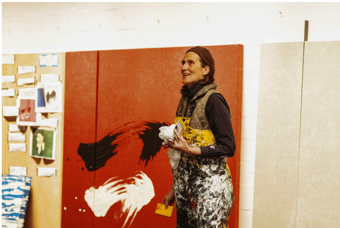
Fabienne Verdier in her studio, 2024.