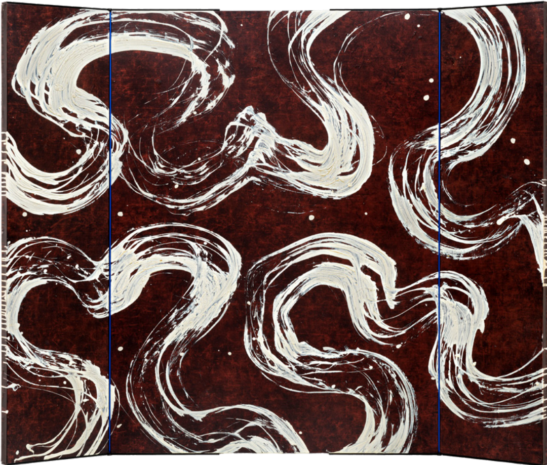
Fabienne Verdier, 'Dans l'air des hautes terres / In the highland air', 2024, acrylic and mixed, media on canvas, 183 x 226 cm.