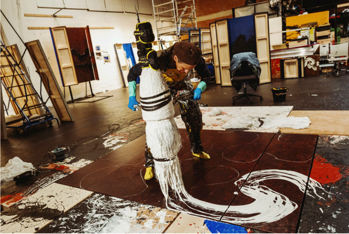
Fabienne Verdier in her studio, 2024.