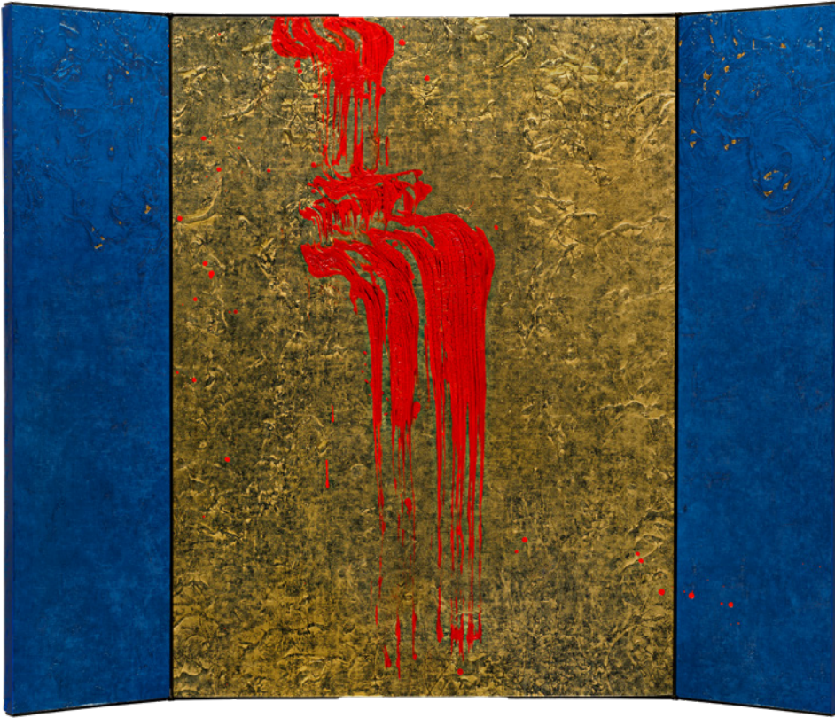
Fabienne Verdier, 'Ode à la vie 1 / Ode to life 1', 2024, acrylic and mixed media on canvas, 183 x 226 cm.