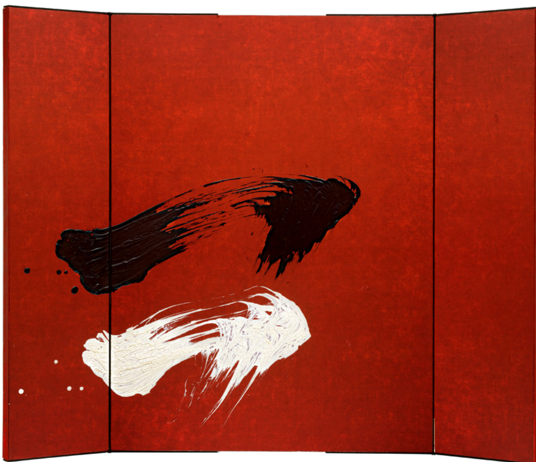
Fabienne Verdier, 'Aux émois des rencontres / To the excitement of encounters', 2024, acrylic and mixed media on canvas, 183 x 226 cm.