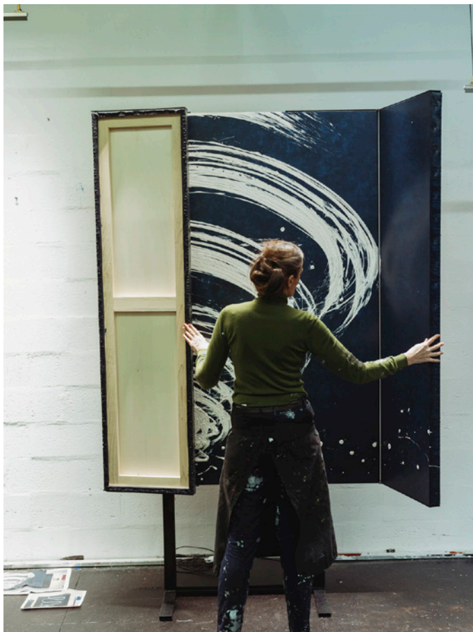
Fabienne Verdier in her studio, 2024.