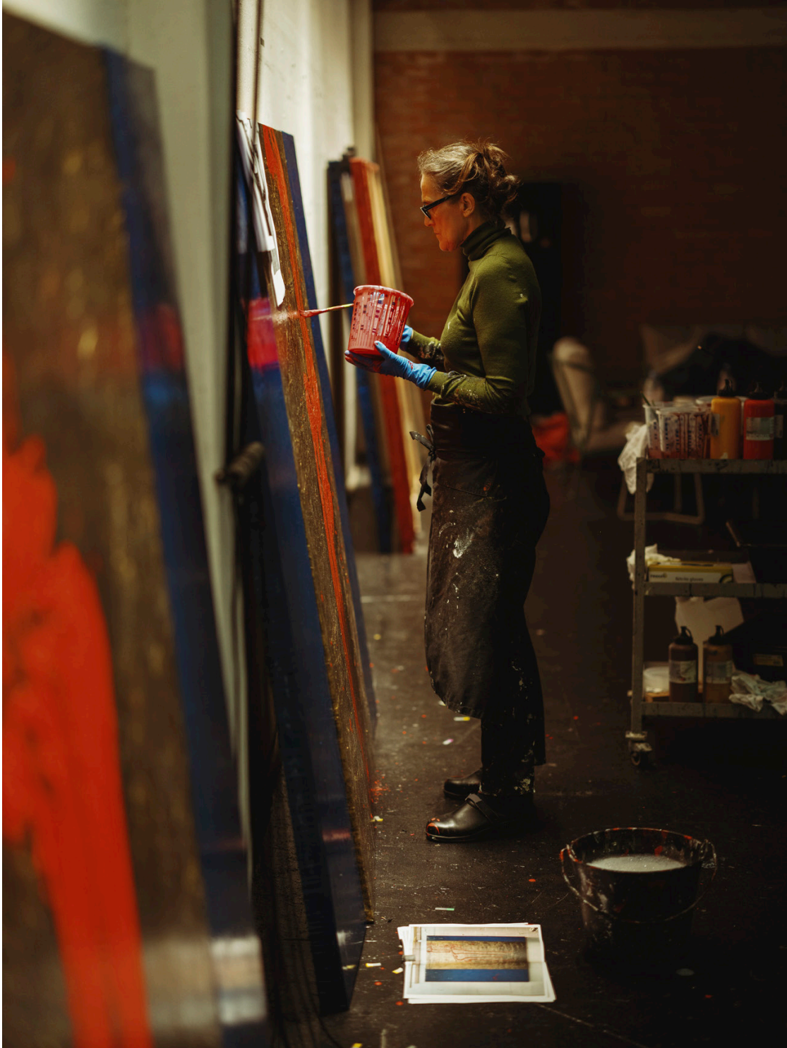
Fabienne Verdier in her studio, 2024.