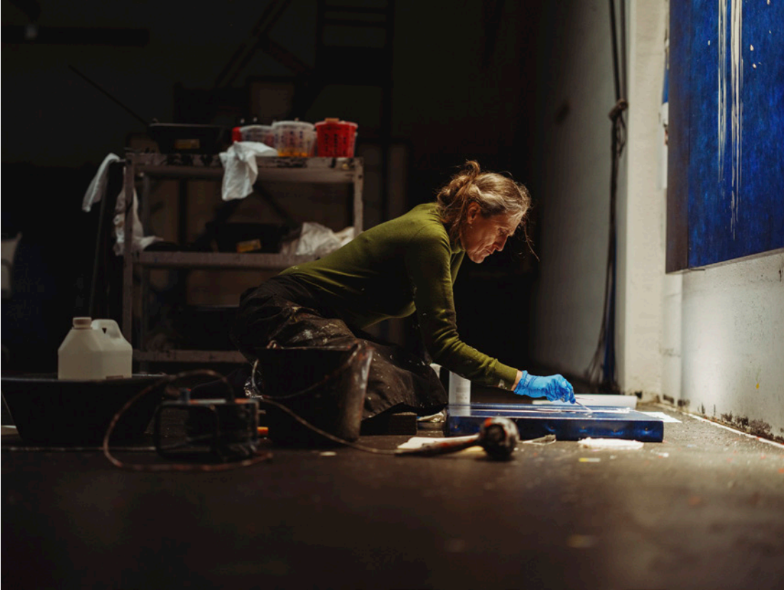
Fabienne Verdier in her studio, 2024.