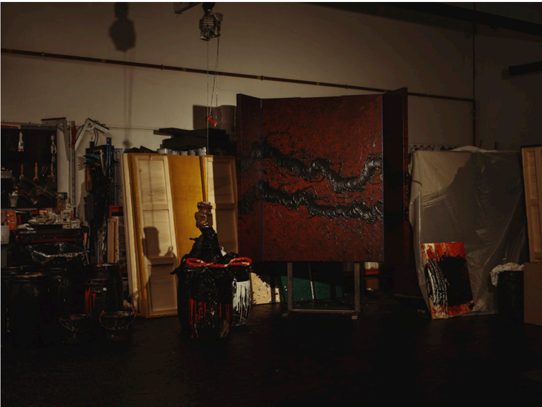
Fabienne Verdier in her studio, 2024.