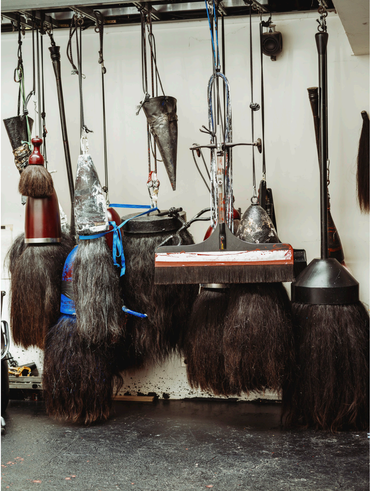
Fabienne Verdier's studio, 2024.